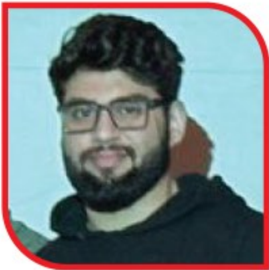
Ali Pro Ultimate Gyms, Saket