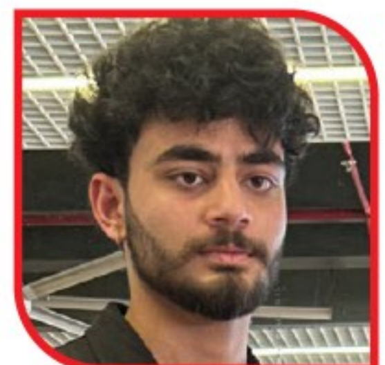
Arun Pro Ultimate Gyms, Phase II, Mohali