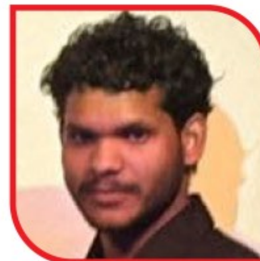
Anoop Pro Ultimate Gyms, Faridabad