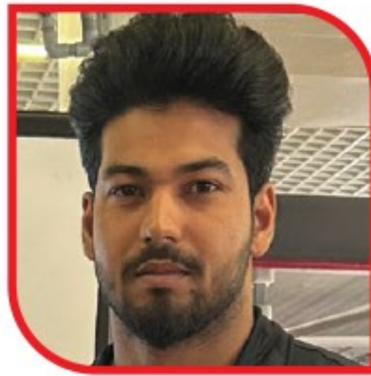
Ajay Pro Ultimate Gyms, Sector 70, Mohali