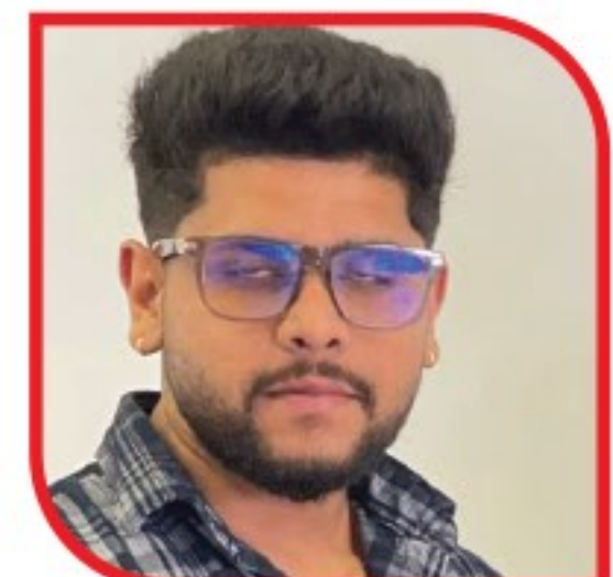
Harjot Pro Ultimate Gyms, Sector 38, Ludhiana