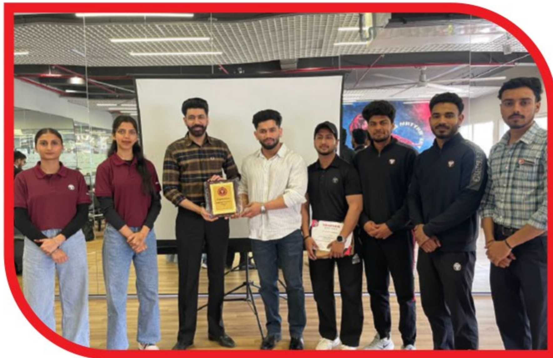
Pro Ultimate Gyms, Kurukshetra