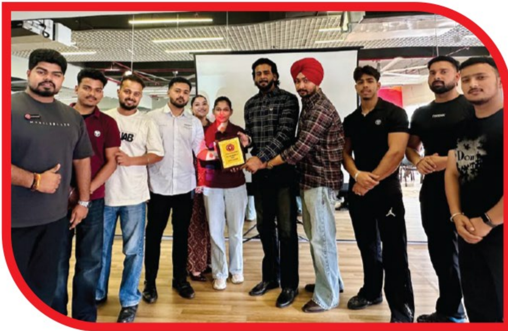
Pro Ultimate Gyms, Sector 68, Medallion, Mohali