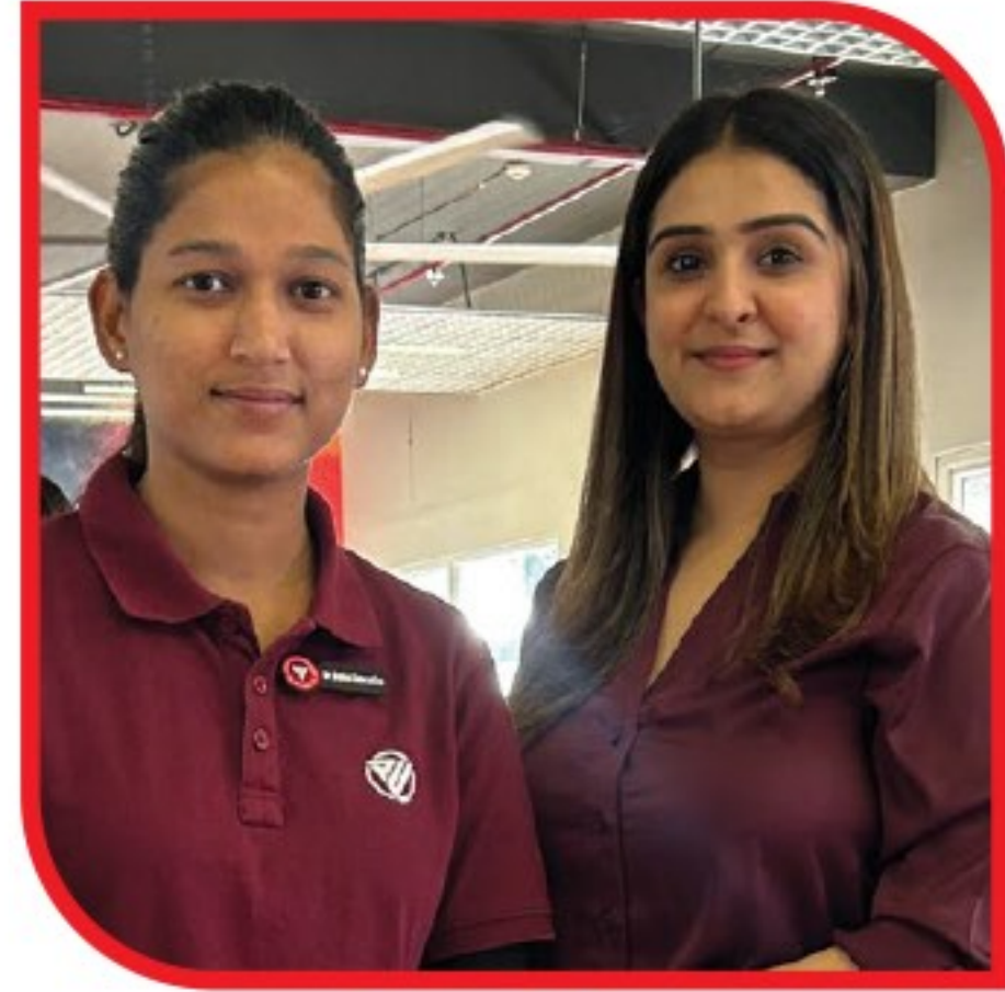
Deepika Sector 68, Mohali