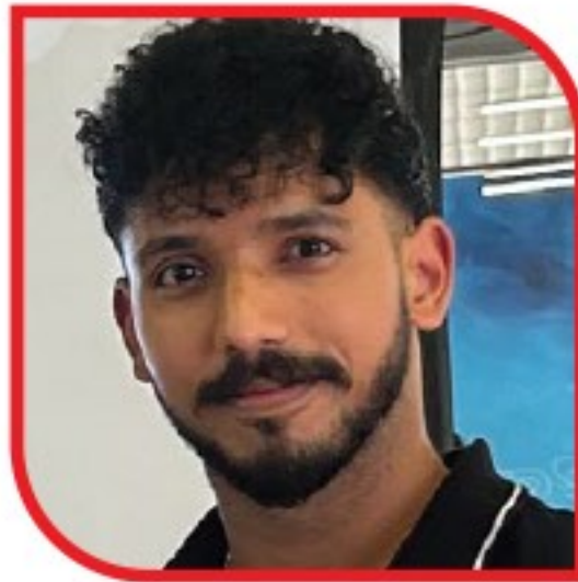
Aman Pro Ultimate Gyms, TDI Mohali