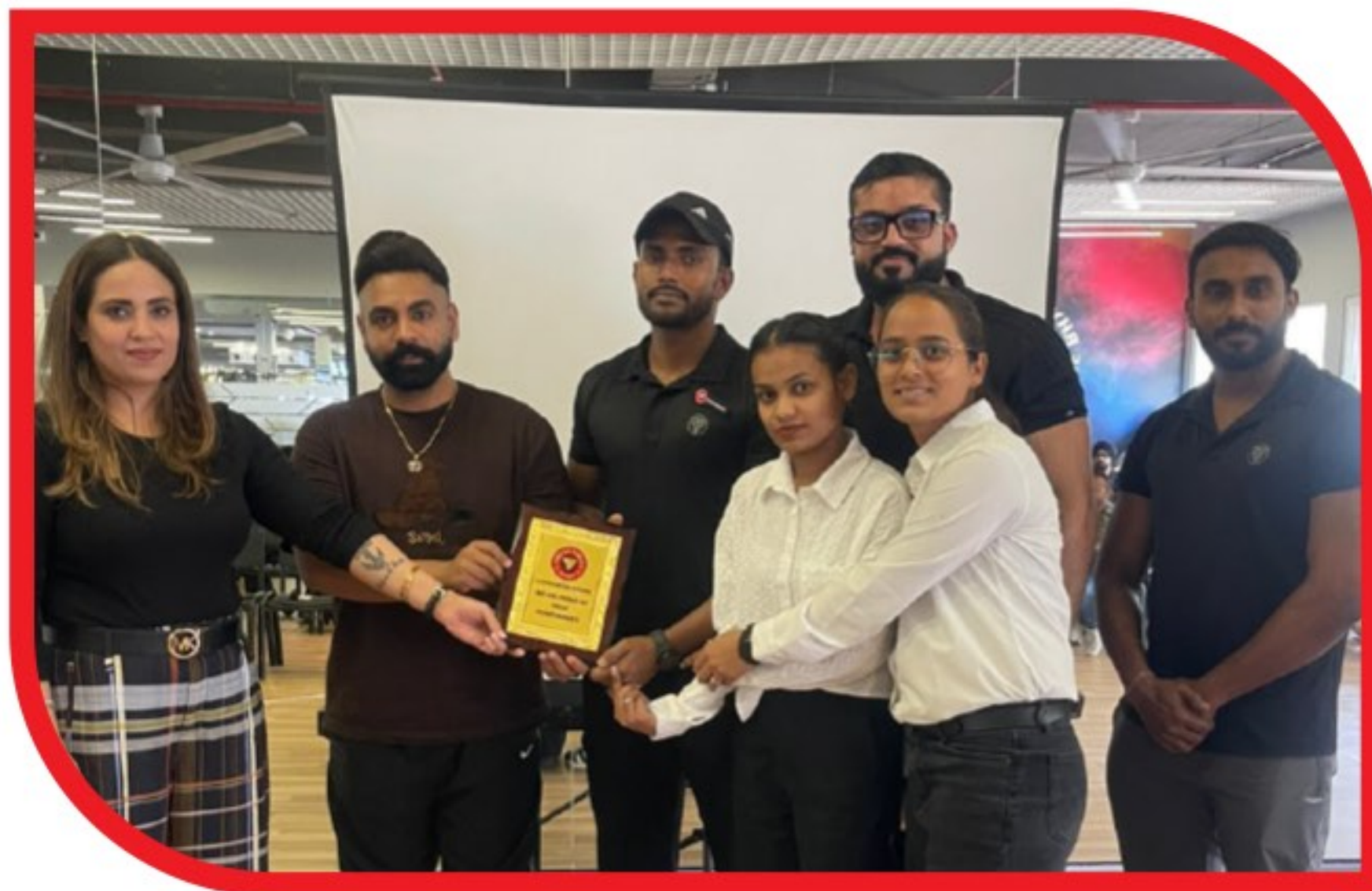
Pro Ultimate Gyms, Sirhind