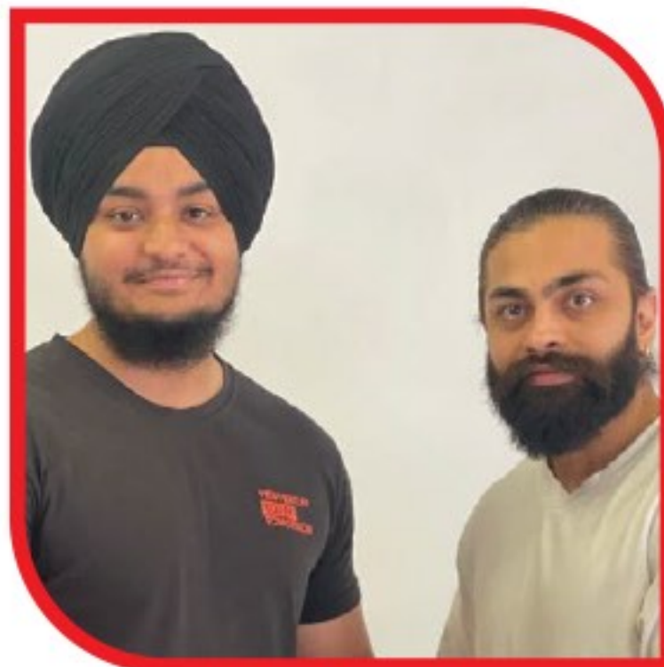
Hardarsh Urban Estate, Dugri, Ludhiana