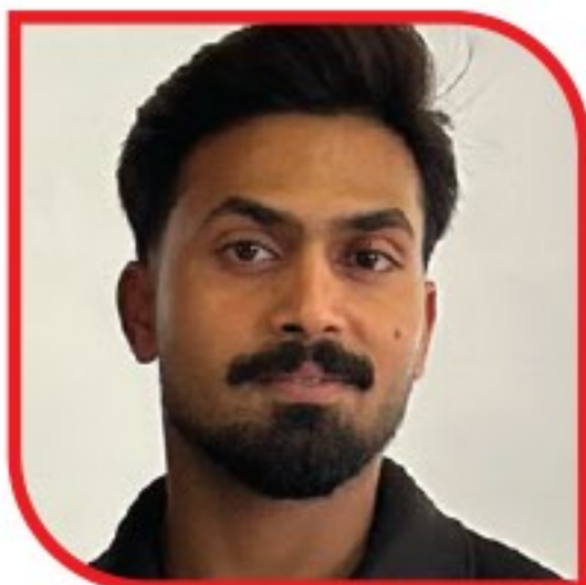
Ankit Pro Ultimate Gyms, Sector 32, Chandigarh