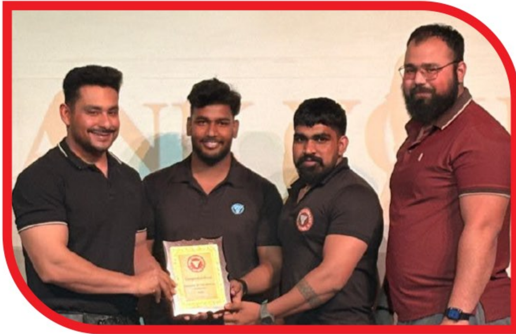
Pro Ultimate Gyms, Sector 48, Gurugram