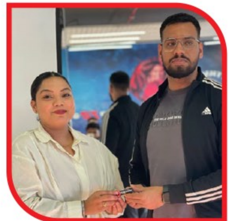
Harjee Urban Estate, Patiala