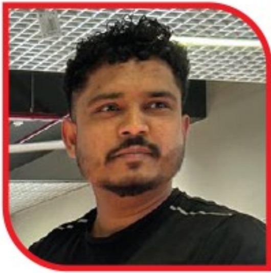
Ajay Pro Ultimate Gyms, Dhakoli, Zirakpur