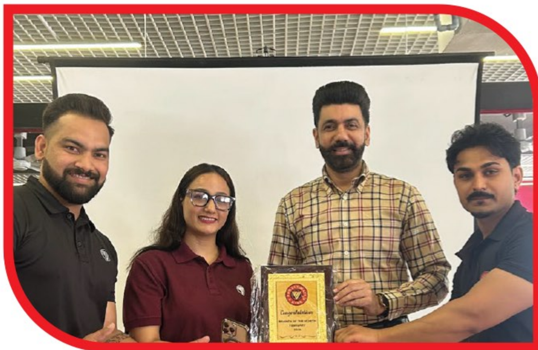
Pro Ultimate Gyms, Sector 38, Chandigarh