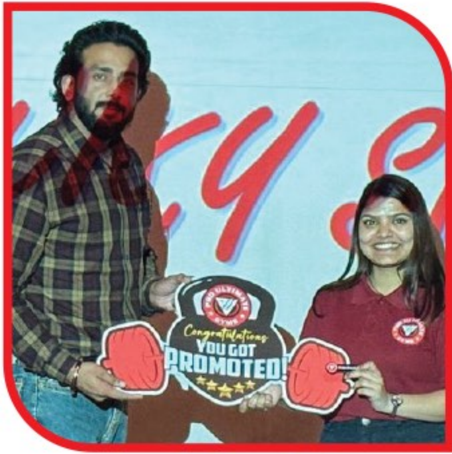
Sheetal Block DP, Pitampura