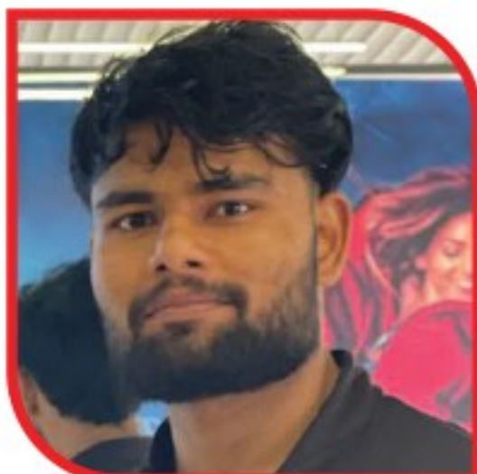
Deepak Pro Ultimate Gyms, Rajpura, Punjab