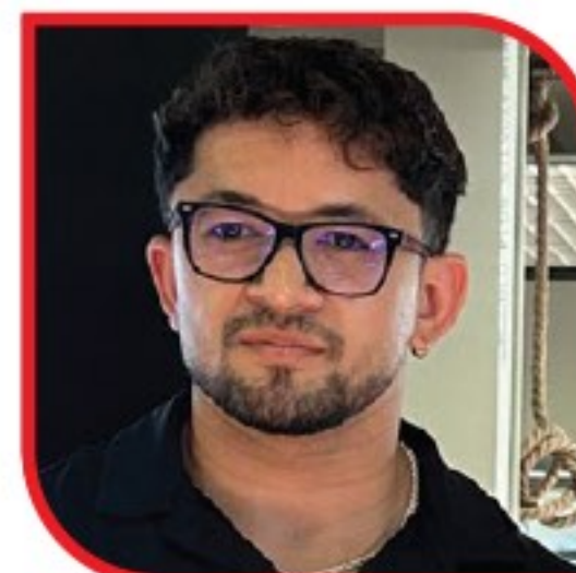
Dishant Pro Ultimate Gyms, Omaxe, New Chandigarh