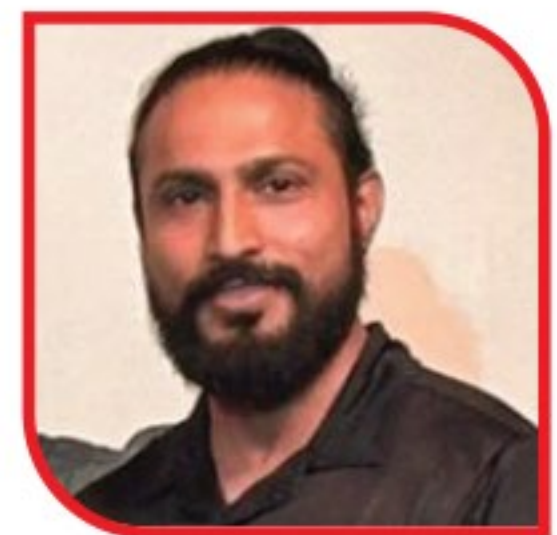
Ajeet Pro Ultimate Gyms, Mahavir Enclave