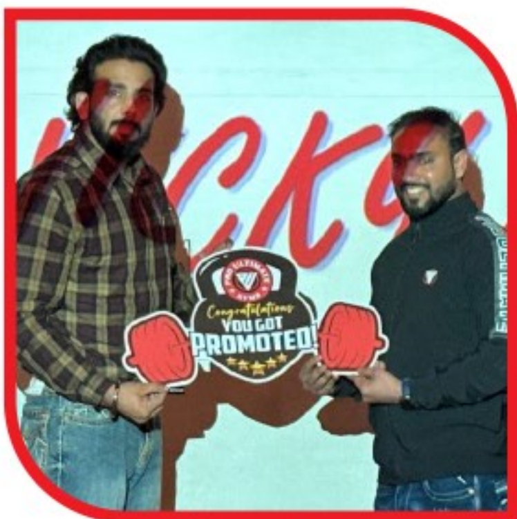
Sandeep Block DP, Pitampura