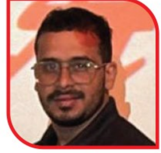
Amit Pro Ultimate Gyms, Sector 62, Gurugram